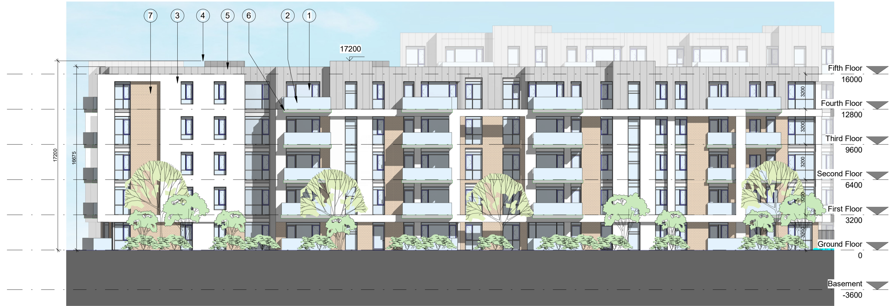
Block 1 West Elevation