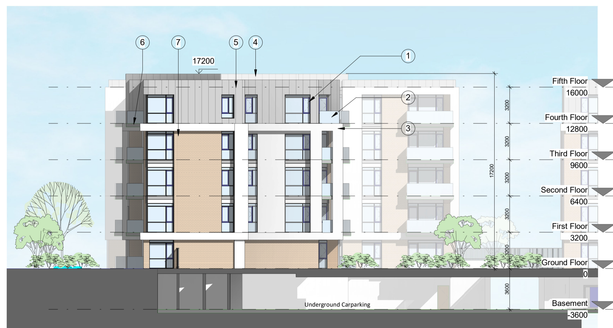
Block 1 South Elevation