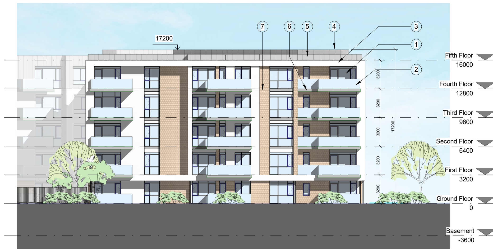
Block 1 North Elevation