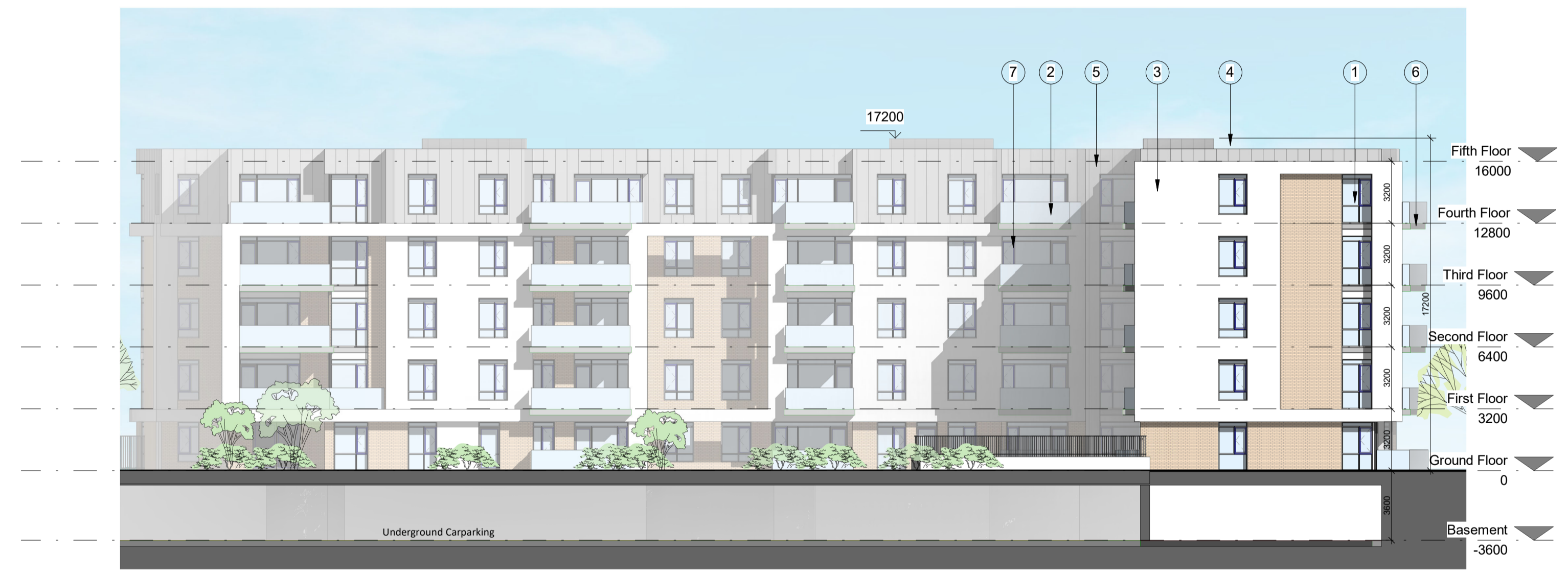
Block 1 East Elevation